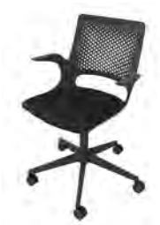
5 Star Leg on Castors

5 Star Leg base or Pyramid Leg on Castors Upholstered seat pad Fixed arms included Black or White shell finish options