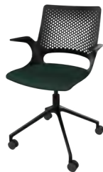
Pyramid Leg on Castors

This range has been designed and manufactured to our high standards of quality and is guaranteed for 5 years.