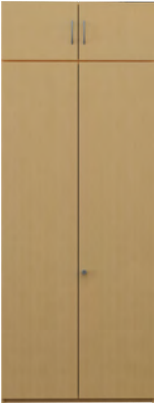
Storage Wall inc. Top Box