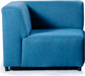
Manhattan Corner/End Section