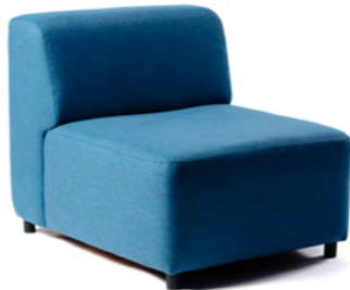
Manhattan Straight Section

Handmade in Yorkshire Available in two modular sections for users to build their perfect sofa Fully upholstered modular sofa section with a strong internal frame Connections and black steel feet included